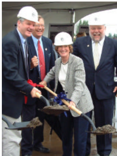
Clark County Commissioner Betty Sue Morris and U.S. Rep. Brian Baird shovel up dirt to officially begin nearly $100 million reconstruction of the I-5/Salmon Creek Interchange at NE 134th Street. State Sens. Don Carlson and Don Benton also participated.

Clark County commissioner Betty Sue Morris and U.S. Rep. Brian Baird (D-3rd) were among dignitaries shoveling the first dirt to begin a nearly $100 million project to bring relief to what some say is the second worst transportation crossing after the Columbia River in Clark County, the Interstate 5-Salmon Creek Interchange at 134th Street.