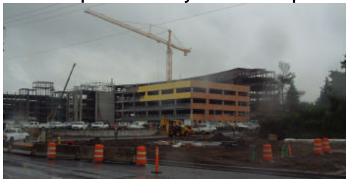
Construction is continuing at Legacy Salmon Creek Hospital. 220-bed medical facility will open for patients in mid-2005. Medical office buildings in foreground are four stories each. The 1,500-stall parking garage to the left will rise six levels above ground and the 46,000-square-foot hospital, just off NE 134th Street, will be will be seven stories tall.