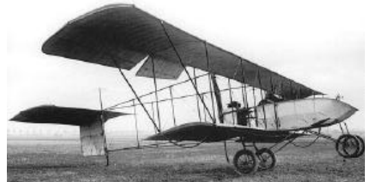
Rare 1913 Voisin on display at Pearson

On display on the museum's floor, where attendees can have their picture taken in the cockpit, will be a replica of a 1913 Voisin, 38 feet long, with a 51-foot wingspan. With a top speed of 58 miles an hour, the Voisin could take off at 30 miles an hour. It carried a two-man crew. It was the first aircraft built specifically to be a bomber, and it was credited in World War I with the first air-combat