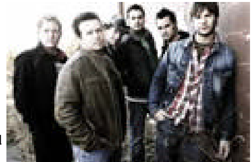
Country musicians Emerson Drive open the entertainment venue at Clark County Fair at 7:30 p.m. Friday, Aug. 3, in the main stage. Reserved seating is $18 through Ticketmaster. Grandstand seating is free with fair admission.