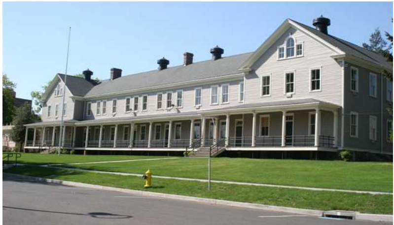
Artillery Barracks in Vancouver National Historic Trust could become part of 70-room hotel-type inn.