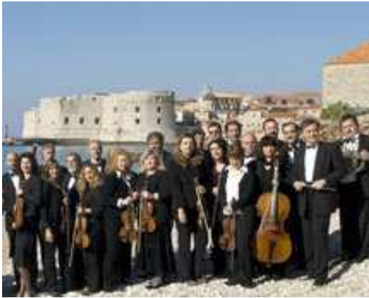
From the shores of the Adriatic Sea comes the Dubrovnik, Croatia Symphony Orchestra, touring the Pacific Northwest with The Bravo! Vancouver Chorale. The Vancouver performance is at 7:30 p.m. Tuesday, Sept. 30.

Bravo! Vancouver, in its 15th year of bringing an eclectic mix of classical, jazz and avant-garde music to Vancouver, opens its 2008-2009 season with seven performances by the Dubrovnik Symphony Orchestra, most of which will be accompanied by the Bravo! Vancouver Chorale.