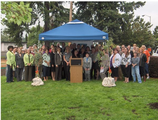
Pictured here are the many that gathered for YWCA's celebration for winning $15,000 from Umpqua's Click 4A Cause campaign.