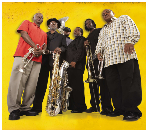
Dirty Dozen Brass Band