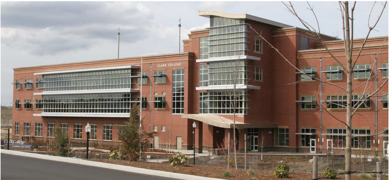
Clark College Columbia Tech Building

As it concludes its yearlong 75th anniversary celebration, Clark College will dedicate its newest facility, the Clark College at Columbia Tech Center (CTC), at 11 a.m. on Monday, Sept. 28. The community is invited to attend the dedication of the new building, located at 18700 SE Mill Plain Blvd., Vancouver.